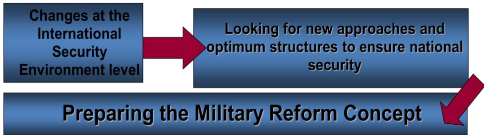
Figure 1. The Second Period of the National Defence Policy.